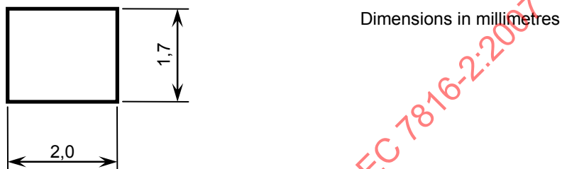
Figure 1 — Minimum dimensions of the contacts

This part of ISO/IEC 7816 does not define the maximum dimensions or shape of the contacts except for the requirement that each contact shall be electrically isolated from the other contacts.