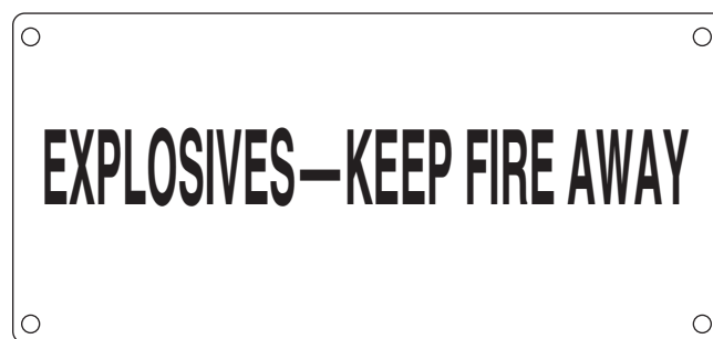
FIGURE 5.4.2.4 Warning Statement on Type 2 Indoor Magazines.